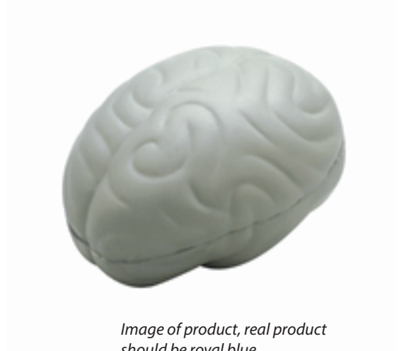
Image of product, real product should be royal blue.